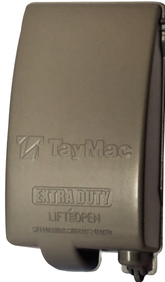
Metal Low-Profile In-Use Cover

Protection for Single Gang Applications. Meets 2008 NEC 406.8 (B)(1) code Mounts Vertically, 3 1/8" Depth