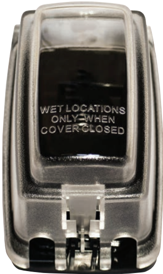
In-Use Weatherproof Receptacle Cover

Protection for Single Gang Applications. Meets 2008 NEC 406.8 (B)(1) code Mounts Vertically, 3 1/8" Depth