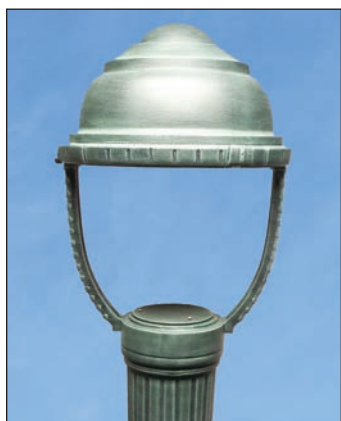
Shown (above): NL PLC11 Pewter Patina.

The Florence II luminaire, like the original Florence style, offers an authentic old world look with the modern conveniences of street lighting techniques used today. Replacing the original four-strut design, two of the cast aluminum side struts have been removed, with the remaining two featuring a decorative leaf pattern. A stylishly fluted ballast housing capital also completes the unique look set forth by the Florence II. The entire housing is constructed of cast aluminum,